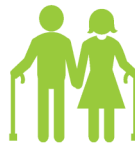
Adult Day Care