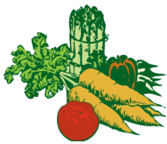
Meal or Grocery Delivery

We need to prepare to care for our rapidly growing senior population. One key way to do this is to provide more seniors the right care and support to stay in the place they call home. A few examples of these home and community-based services: