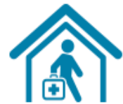
Home Health Care Services